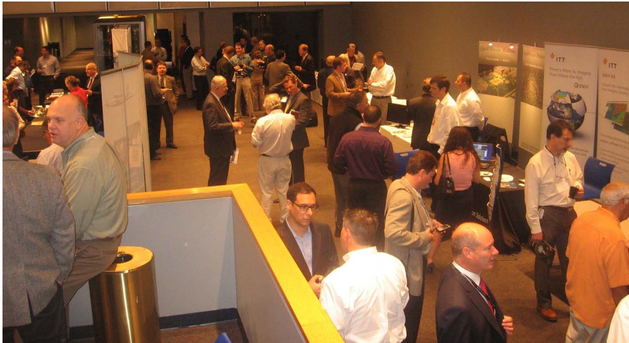
GeoTech 2011: Exhibit Hall

Eleven companies and organizations exhibited at GeoTech 2011, including: Tuck Mapping Solutions, Pictometry (also a conference sponsor), ITT, Fugro, Brandywine Photonics, ASPRS, Applied Imagery, GeoEye, UMBC, LizardTech, and NOAA's National Geodetic Survey.