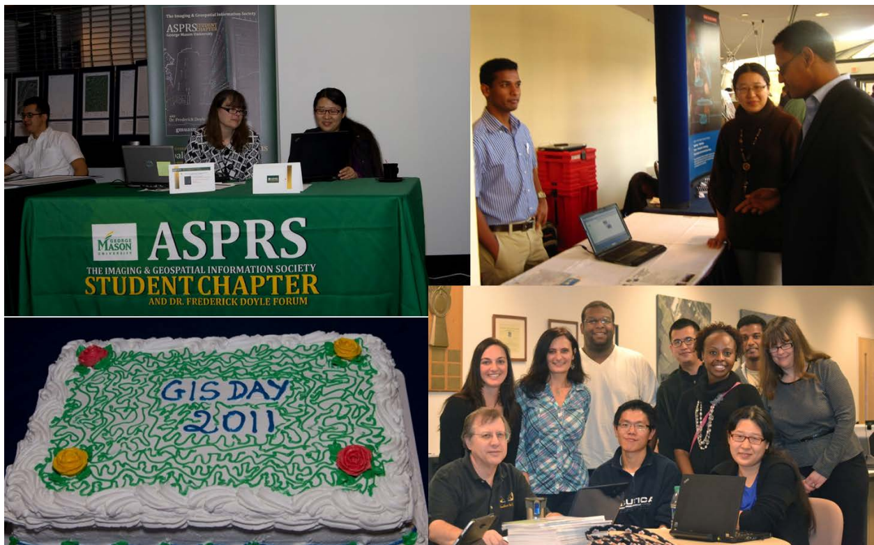
The Frederick Doyle Student Chapter and Forum at GMU.